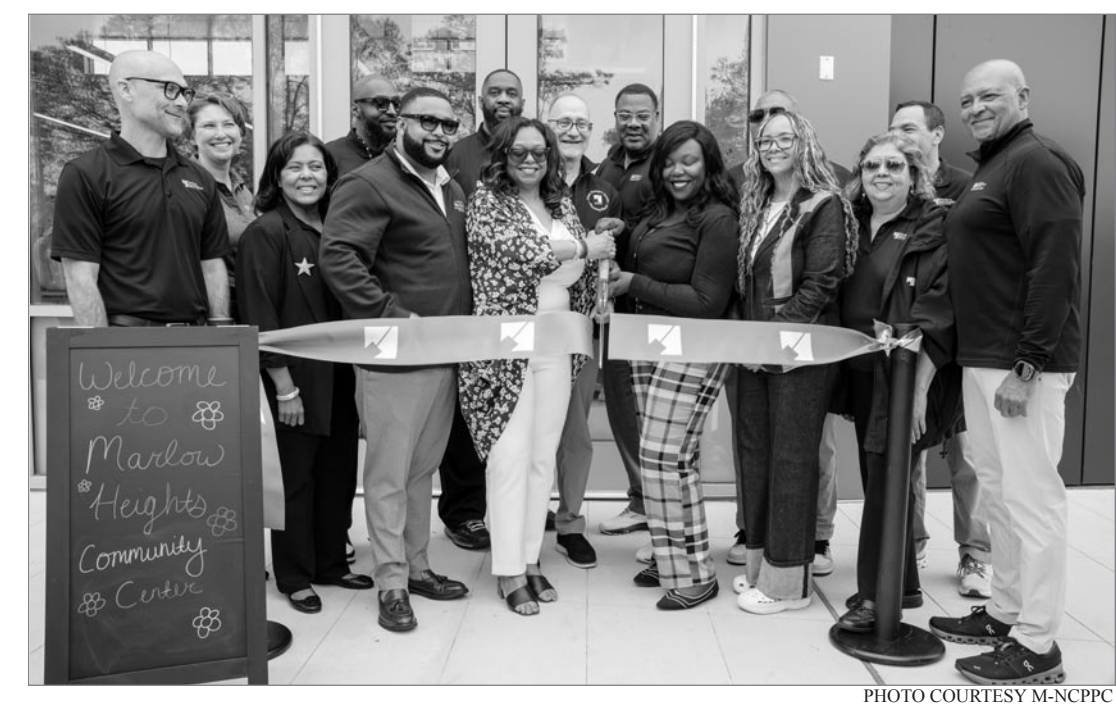
M-NCPPC, Department of Parks and Recreation, Prince George's County, along with elected officials and the community, celebrated the grand reopening of the new Marlow Heights Community Center on Saturday, April 19.