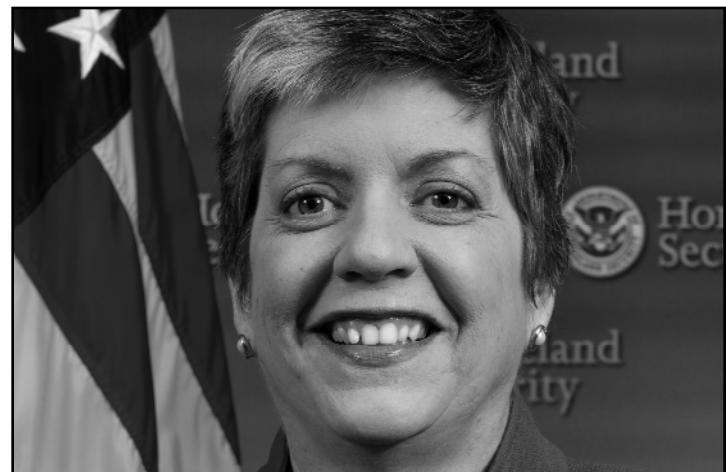
Secretary of Homeland Security Janet Napolitano

Finally, USCIS is launching a new series of engagement opportunities for entrepreneurs and startup companies. These opportunities will focus on soliciting input from stakeholders on how USCIS can address the unique circumstances of entrepreneurs, new businesses and startup companies through its policies and regulations in the employment-based arena. For detailed information on USCIS's public meetings, please visit www.uscis.gov/outreach .