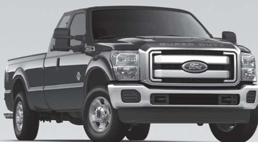
2011 SUPER DUTY ®