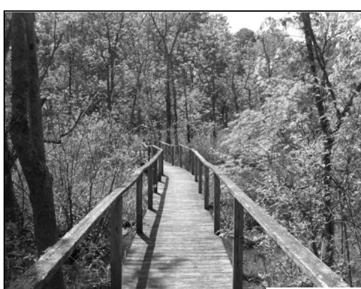
BY INDIANA JONES

wait was well worth it. Saunter on down and take your time – there are lovely new benches along the way for whiling away the afternoon. Use the ramp that leads to the beach along the living shoreline. Watch the tide flow in and out of the creek and the tidal gut on the northern end of the walkway. Enjoy!