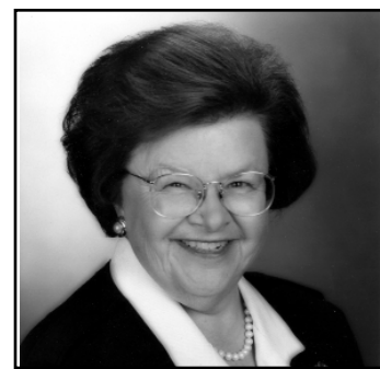
FILE PHOTO Senator Barbara A. Mikulski

that a Continued State of Emergency exists within the entire state beginning September 8, 2011. Given the State resources already in use as we recover from a hurricane just two weeks ago, supplementary federal assistance is necessary to save lives and protect property, public health, and safety, or to lessen or avert a disaster.