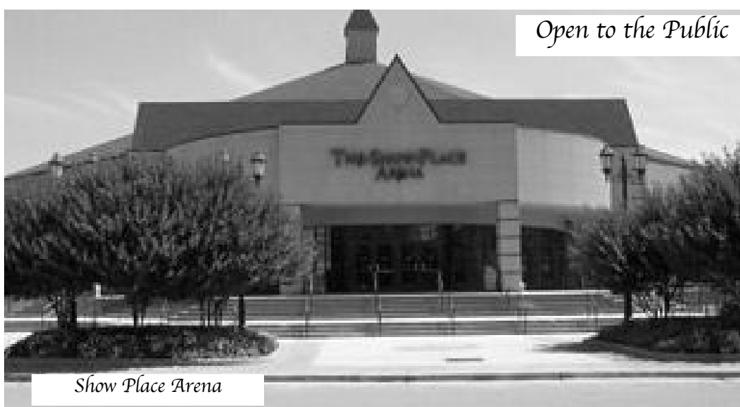
The Show Place Arena in Upper Marlboro, Maryland has everything you need to make your next event an unqualified success — hospitality, location, space, and versatility. The Show Place Arena and Prince George's Equestrian Center are facilities of The Maryland-National Capital Park and Planning Commission, Department of Parks and Recreation/Prince George's County, Maryland. For information on this and other facilities, classes and parks, visit www.pgparcs.com.