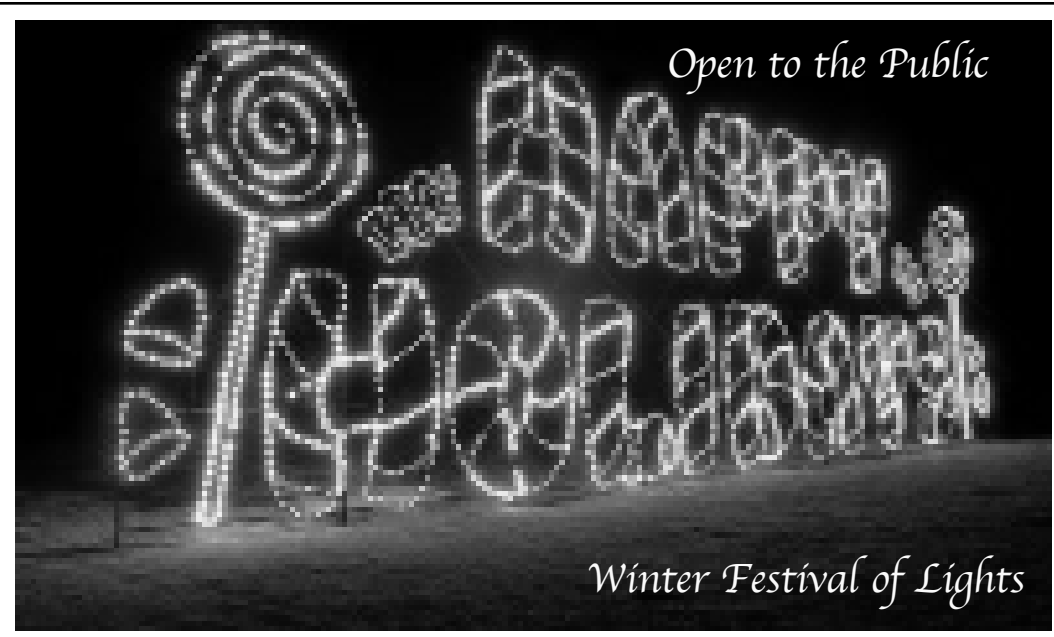
Open to the Public

After he retired from boxing Joe Frazier’s Gym became an important part of the Philadelphia neighborhood. Though it’s no longer a training facility, fans and former students flocked to the building upon learning of Frazier’s death. It had been a safe haven for young people, a center of the community. In contrast to the violence and sometimes hopelessness of the streets outside, young people learned discipline and hard work, and their lives were changed forever thanks to Smokin’ Joe.