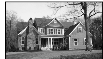
This home affordable and attractive.