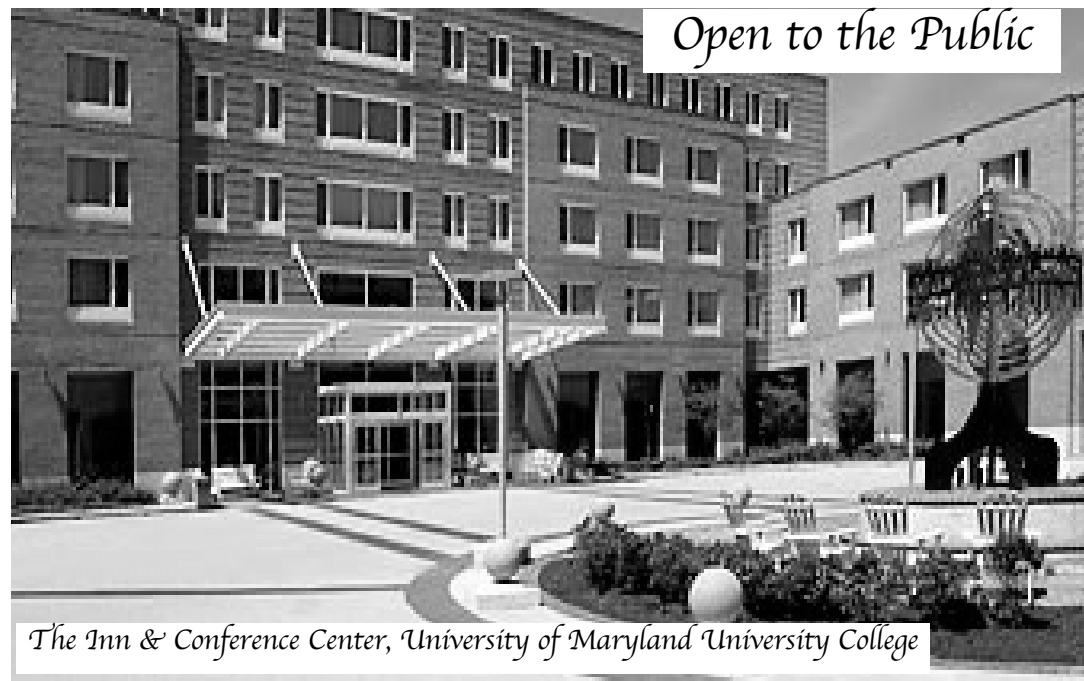
The Inn & Conference Center, University of Maryland University College