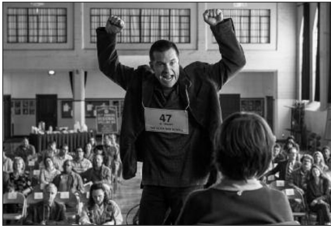
Jason Bateman plays Guy Trilby a 40-year old who finds a loophole in the rules of the National Quill Spelling Bee and decides to cause trouble by hijacking the competition. Contest officials, outraged parents, and overly ambitious 8th graders are no match for Guy, as he ruthlessly crushes their dreams of victory and fame. As a reporter attempts to discover his true motivation, Guy finds himself forging an unlikely alliance with a competitor: awkward 10-year old Chaitanya, who is completely unfazed by Guy’s take-no-prisoners approach to life.

The film begins with the story already in progress. We’ve missed whatever the inciting incident was, along with any backstory to explain (or at least hint at) Guy’s motive for his frankly bizarre endeavor. Exploiting a loophole in the rules that lets him participate in the Golden Quill National Spelling Bee regardless of age as long as he never graduated from eighth grade, Guy is relentlessly crush-