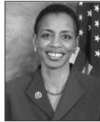
Congresswoman Donna F. Edwards