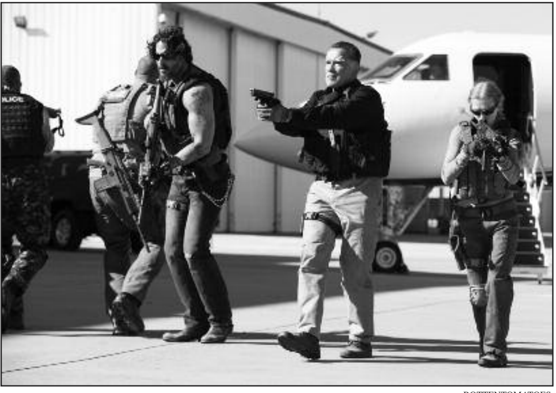
An elite DEA task force takes on the world's deadliest drug cartels, and when they successfully execute a high-stakes raid on a cartel safe house, they think their work is done ... until, one-by-one, the team members mysteriously start to be eliminated. As the body count rises, everyone is a suspect.

We meet the team in the middle of a mission that ends with them