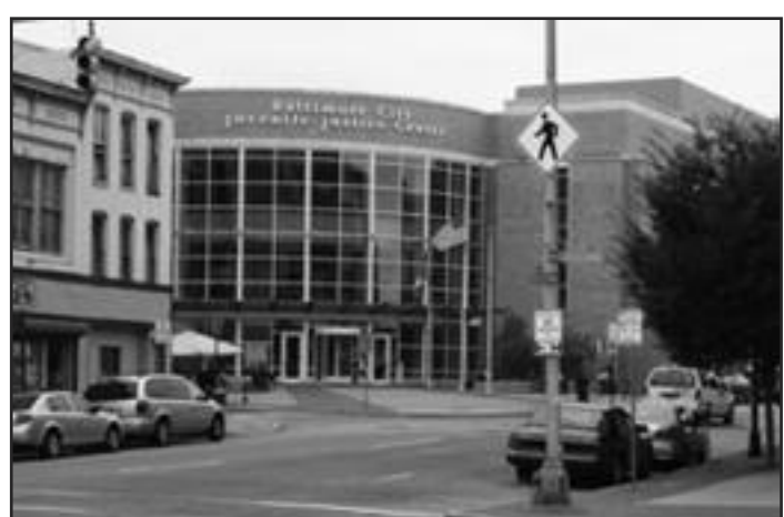
Waxter Juvenile Detention Ceter in Laural, Maryland.

Solomon wrote that 62 individual girls were responsible for the 117 incidents in 2013, and 51 girls were responsible for the