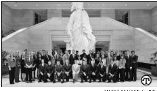
The Top 10 teams at the Awards Reception in the Capitol Visitor Center.

(NAPSI)—Are you interested in learning more about the importance of saving and investing and possibly having your member of Congress visit your school? Learn more about the Capitol Hill Challenge.