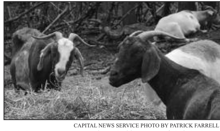
Each day, goats eat approximately 20 percent of their body-

"To most people, goats are pretty cool!"