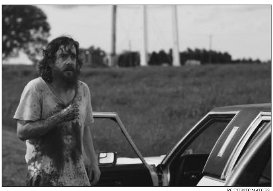
BLUE RUIN is a classic American revenge story that recently won the FIPRESCI International Critics Prize at the Cannes Film Festival. The film follows a mysterious outsider whose quiet life is turned upside down when he returns to his childhood home to carry out an act of vengeance. Proving himself an amateur assassin, he winds up in a brutal fight to protect his estranged family.

Dwight seems to have already considered what he would do if