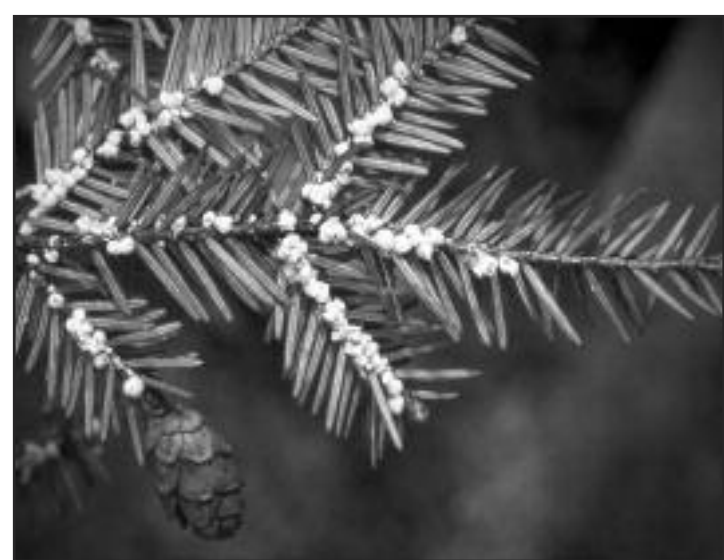
Invasive pest Adelges tsugae Annand, Common Name: hemlock woolly adelgid.

"If we don't go after this invasive species, we stand to lose hemlock trees throughout Maryland and West Virginia, which would seriously disrupt the ecology of the area," said Deborah Landau, conservation ecologist for The Nature Conservancy's Maryland/DC chapter. "There's simply no ecological equivalent to hemlock in this area and with this keystone tree species we stand to lose a number of rare and significant plant and wildlife species."