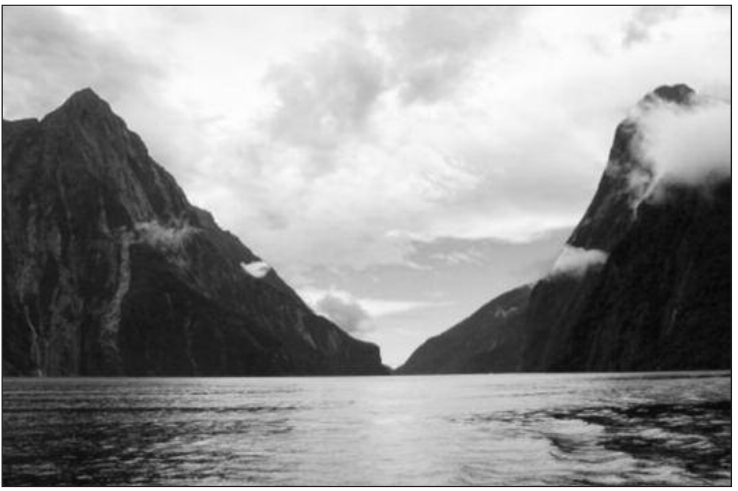
Photograph of Milford Sound, New Zealand,