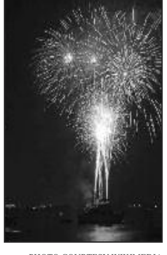
Independence Day fire works in San Diego.

count for two out of five of those fires, more than any other cause of fires.