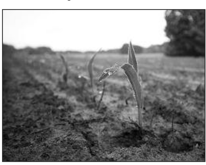
The increase in farmland acreage has coincided with record

From a Chesapeake Bay perspective, farmlands provide important habitats for many types of birds and animals.