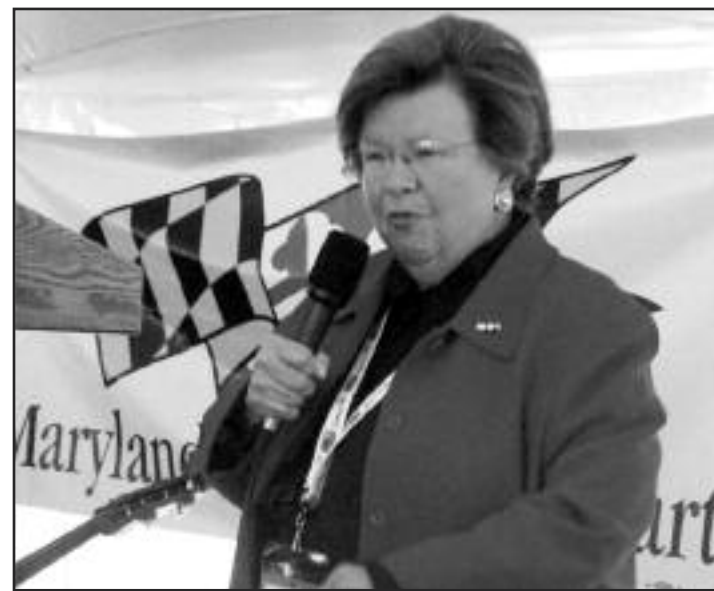
U.S. Senator Barbara A. Mikulski (D-Md.), Chairwoman of the Senate Appropriations Committee, announced that Congress has passed the Consolidated Appropriations Act of 2014

lion to continue the manufacture of Multirole Enforcement Aircraft (MEA) used to protect our borders by the Customs and Border Patrol (CBP) Air and Marine Program, supporting 500 jobs in Hagerstown. The MEA Program is part of CBP's aviation modernization plan to replace, upgrade and standardize their 30-year-old fleet. These planes communicate with CBP officers on the ground to let them know where illegal activity is happening and help them cover a broader area with fewer resources.