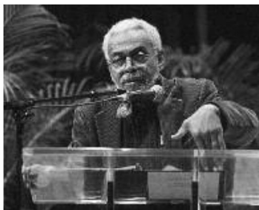
Amiri Baraka always challenged us to face such uncomfortable truths – and we are better because of it.

Controversy was a mainstay of Amiri Baraka's career. Ishmael Reed, another provocative poet and contemporary of Baraka recently noted, "Amiri Baraka was controversial because his was a perspective that was considered out of fashion during this post race ghost dance, the attitude that says that because we have a black president, racism is no longer an issue, when the acrimonious near psychotic reaction to [Barack Obama's] election only shows the depth of it."