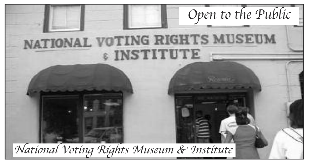
Near the foot of the Edmund Pettus Bridge in Selma, AL, the Museum and Institute offers America and the world the opportunity to learn the lessons from the past. Housed in this museum are exhibits that remind everyone of the struggle to secure the rights for all Americans to vote, regardless of race, education or wealth.