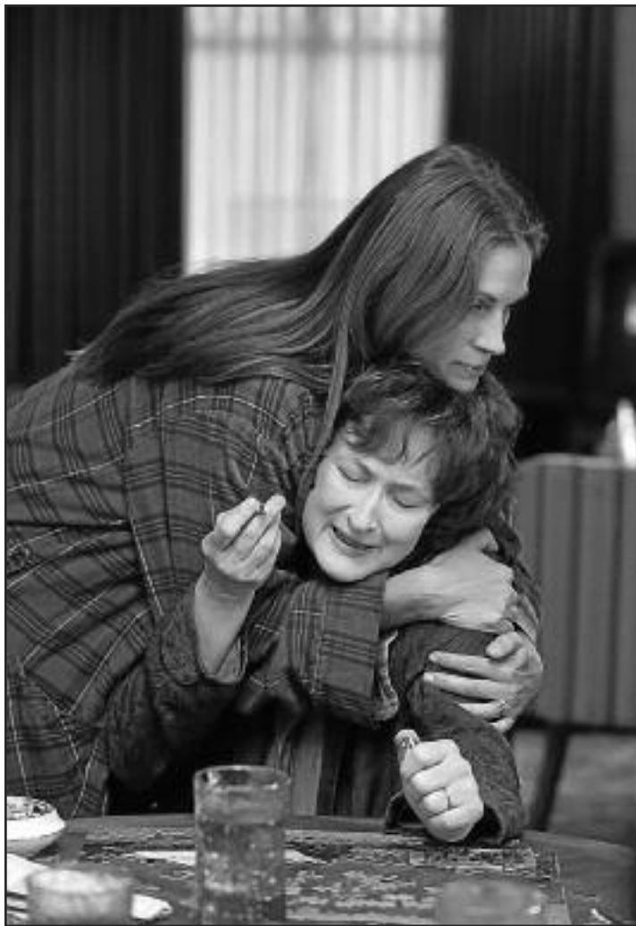
A look at the lives of the strong-willed women of the Weston family, whose paths have diverged until a family crisis brings them back to the Oklahoma house they grew up in, and to the dysfunctional woman who raised them.

It is a fun way to spend a couple hours, though. (Fun for us, I mean. It’s miserable for them.) The occasion is the disappearance of Beverly Weston, who has occasionally run off before but never for this long. The dutiful middle daughter, Ivy (Nicholson), still lives in town, while the others have fled: headstrong Barbara (Roberts) and her husband Bill (McGregor) to Colorado; trashy Karen (Lewis) to Florida, where she’s bagged a showy, Corvette-driving clown of a fiance, Steve (Mulroney). They all come home when Dad goes missing, to help Violet cope and to sort through whatever aftermath there may be. Aunt Mattie Fae and Uncle Charlie (Martindale and Cooper) are on hand, too, joined by their son, Little Charles (Cumberbatch), who’s a disappointment to Mattie Fae and must constantly be defended by Charlie. We learn plenty about everyone’s relationship with everyone else. There’s no need to summarize it all here; suffice it to say that there is no shortage of disagreeable feelings and terrible secrets mixed in with the genuine familial affection that sometimes manifests itself. And it all goes back to Violet — Violet, that brash, opinionated, sometimes cruel wife and