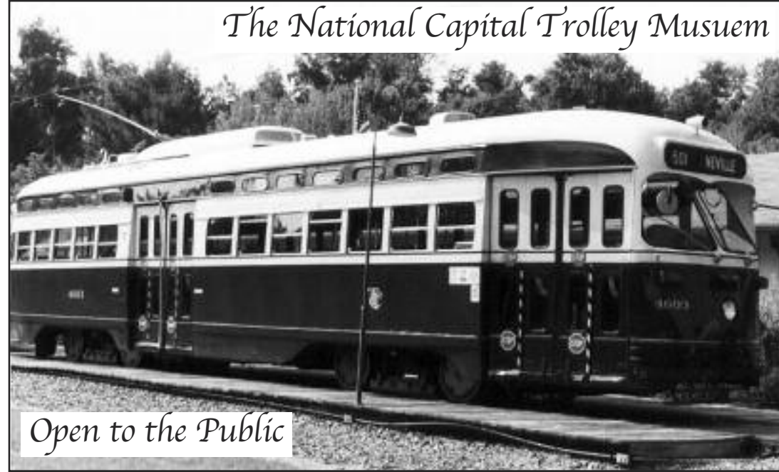
THE NATIONAL CAPITAL TROLLEY MUSUEM

The National Capital Trolley Museum preserves and interprets the heritage of electric and interurban railways of Washington, DC and environs for the benefit of present and future generations, while supplementing its collections with significant national and international objects to enhance its interpretive programs. The National Capital Trolley Museum was founded in 1959 after the abandonment of streetcar service in the District of Columbia had become a certainty. The Museum opened to the public in 1969 at its present location in Northwest Branch Park in Montgomery County, Maryland.