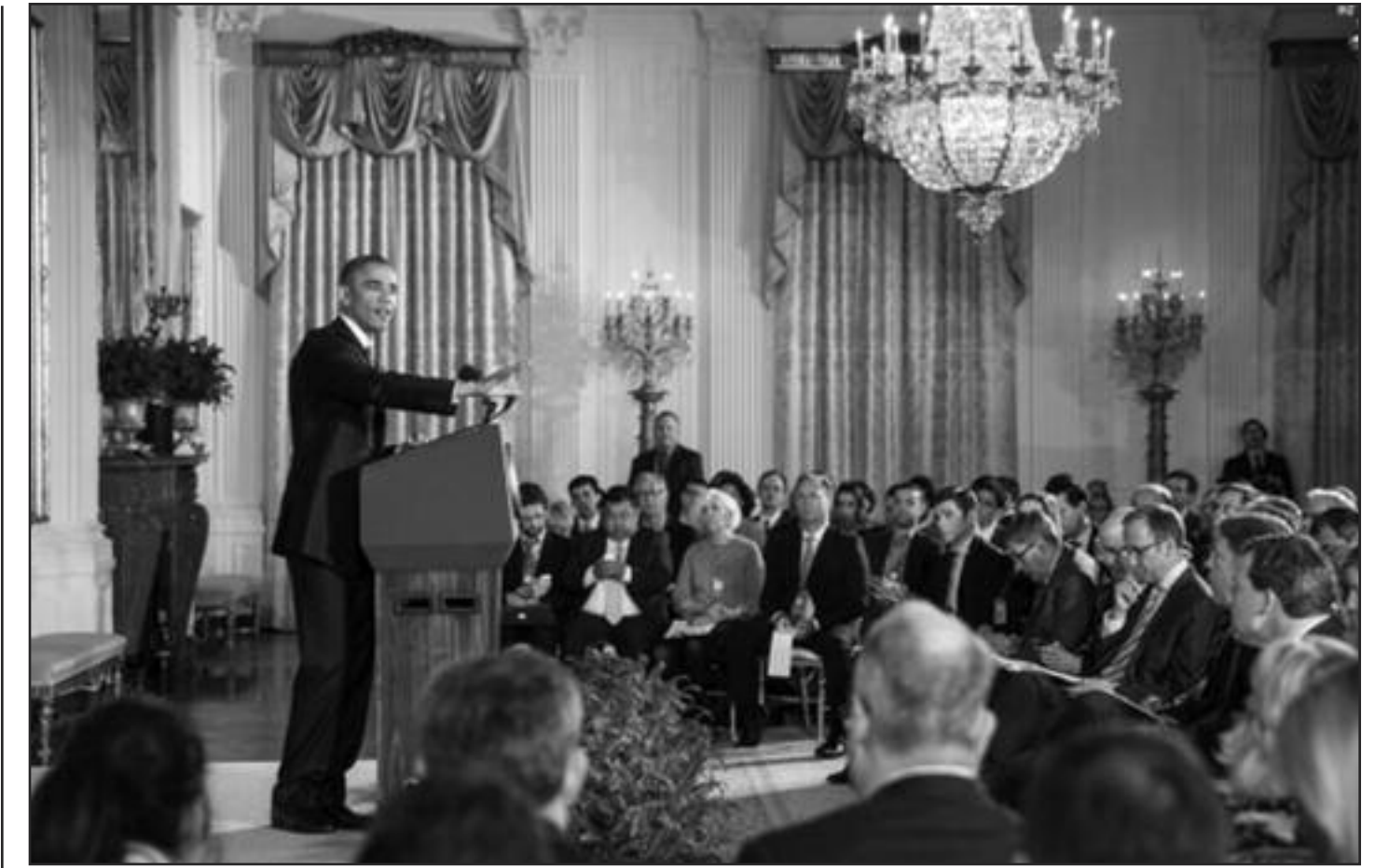
President Barack Obama holds a press conference in the East Room of the White House, Nov. 5, 2014.

ment at a groundbreaking cer- See UNIVERSITY Page A5