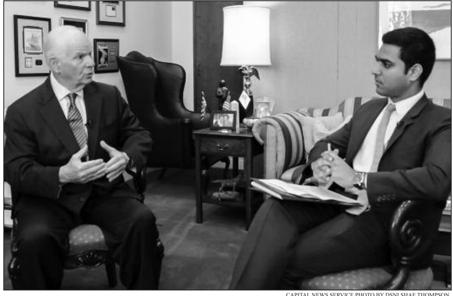
WASHINGTON - Sen. Ben Cardin, D-Md., talks U.S. foreign policy with Capital News Service reporter Idrees Ali.