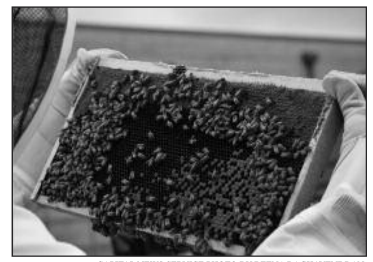
The bees hovered around frames, which is where the creation of honeycomb – and eventually honey – happens.