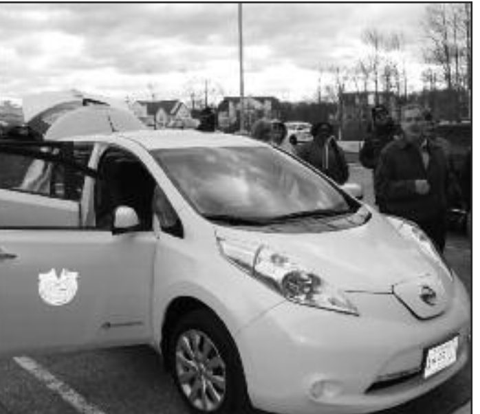
The City Bowie purchase their first totally electric car, powered by an advanced rechargeable lithium ion battery.