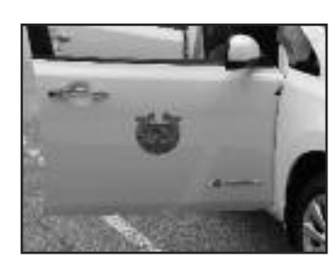
Bowie's new Nissan LEAF electric car.

The City of Bowie recently purchased its first totally electric car. The 2015 Nissan LEAF is powered by an advanced rechargeable lithium ion battery, and will be used for in-city driving by City employees. The LEAF can be driven up to 100 miles on a single charge, depending on speed and use of accessories. The cost of the Nissan LEAF was approximately $29,000. It was purchased as part of Bowie's ongoing efforts to go greener and set the example for others who might be considering purchasing an electric vehicle.